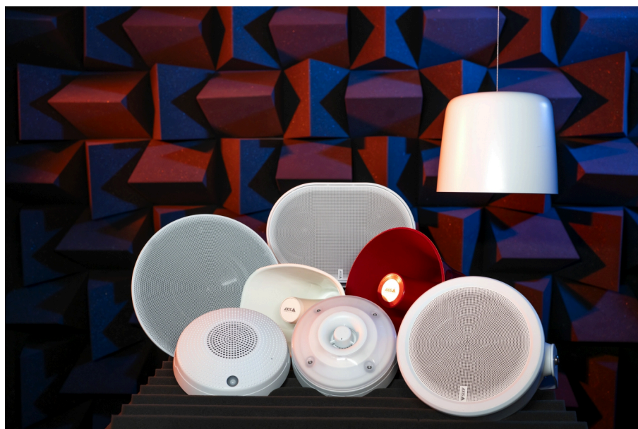
Axis speakers in our R&D labs.

With a validated and reproducible design in place, we leverage digital signal processing to unlock the full potential of our creation.