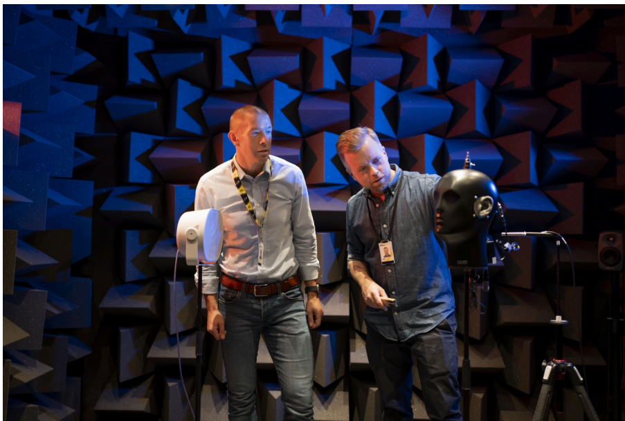
Acoustic measurements in Axis R&D labs

In our state-of-the-art R&D labs, acoustic measurements are instrumental in fine-tuning critical components such as panels, meshes, and waveguides, to achieve optimal performance. By combining industry-leading tools with our own bespoke methodologies, we're able to optimize performance and drive innovation.