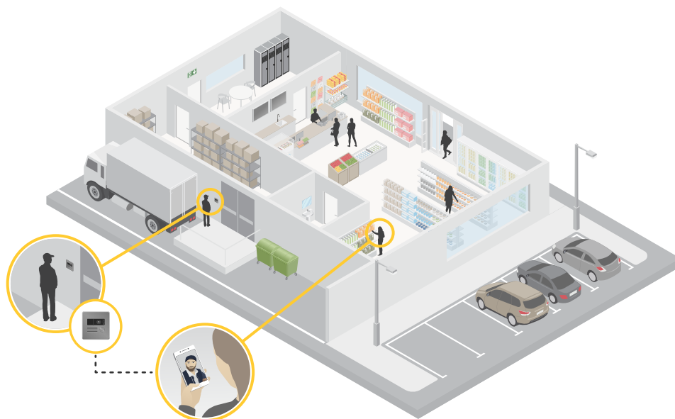
Figure 2. A typical security setup for a small or medium sized enterprise. The video intercom enables staff to receive goods and unlock doors for visitors, without leaving customers unattended.

A typical small system – a handful of network cameras and a single intercom – would usually be found in a small retail store or office. This type of setup covers the basic needs for surveillance and communication. This solution enables, e.g., shop employees to communicate with the truck driver and open the door at the loading dock to receive goods, without having to leave the checkout counter and customers unattended in the store.