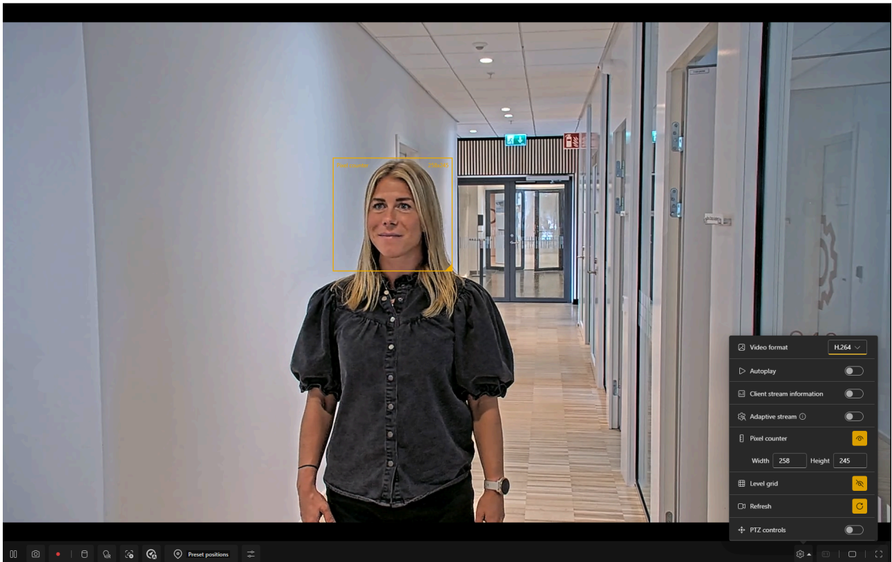
Figure 4.2 A camera view with the pixel counter visible. The tool shows that we have 258 pixels across the frame, which means that Validate is possible (requiring at least 80 pixels across the face).