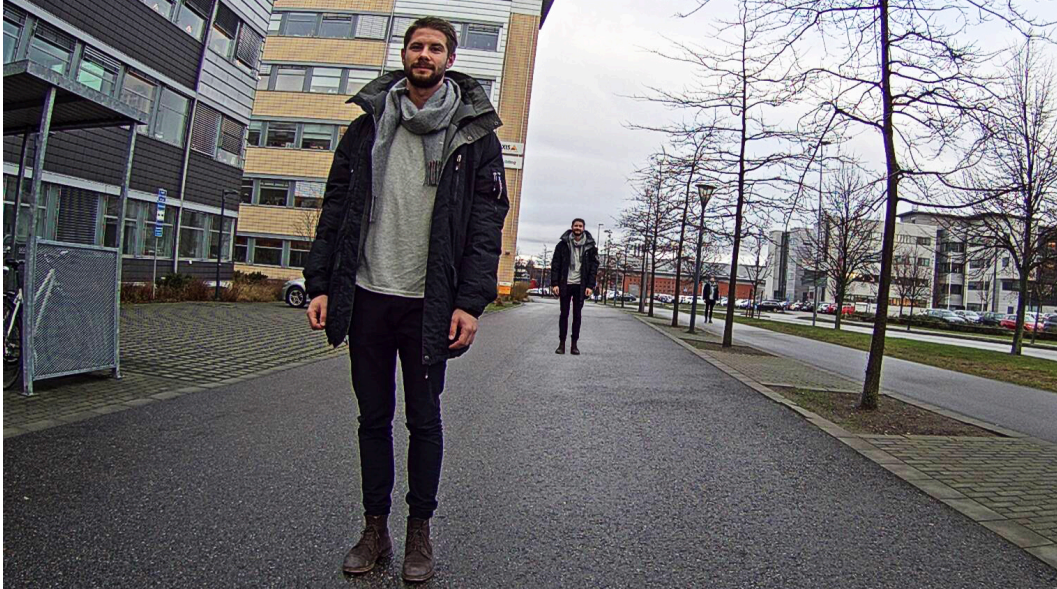
Figure 2.1 A combination of three photos of the same individual in order to represent three of the operational requirement criteria. The person closest to the camera is close enough for characterization. The person in the middle can be recognized, while the person farthest away can only be detected.

It should be noted that the specifications for these operational requirements are valid in situations where visual video images are interpreted by human operators. For video analytics applications or other systems where image analysis is done by software, other definitions for the operational requirements would apply. Thermal imaging, using thermal cameras, also uses a different set of specifications for operational requirements.