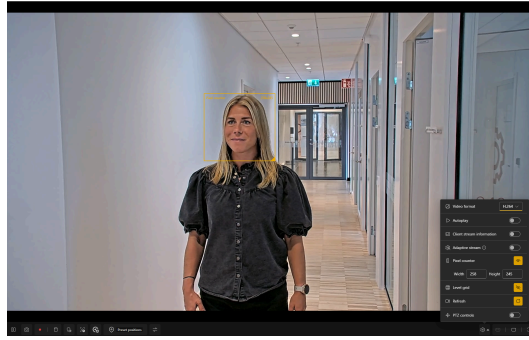
Figure 4.2 A camera view with the pixel counter visible. The tool shows that we have 258 pixels across the frame, which means that Validate is possible (requiring at least 80 pixels across the face).