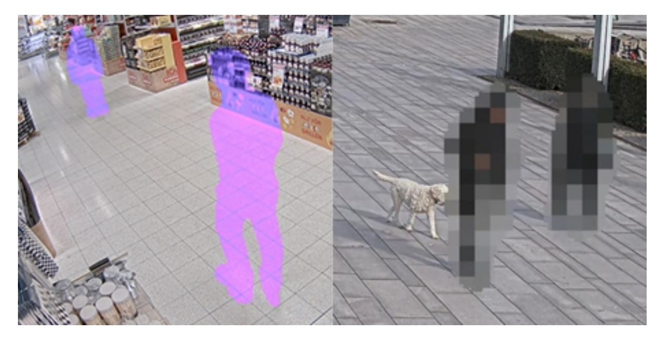
Color masking and mosaic masking.

moving objects or humans in very low resolution and allows you to better distinguish forms by seeing the objects' real colors.