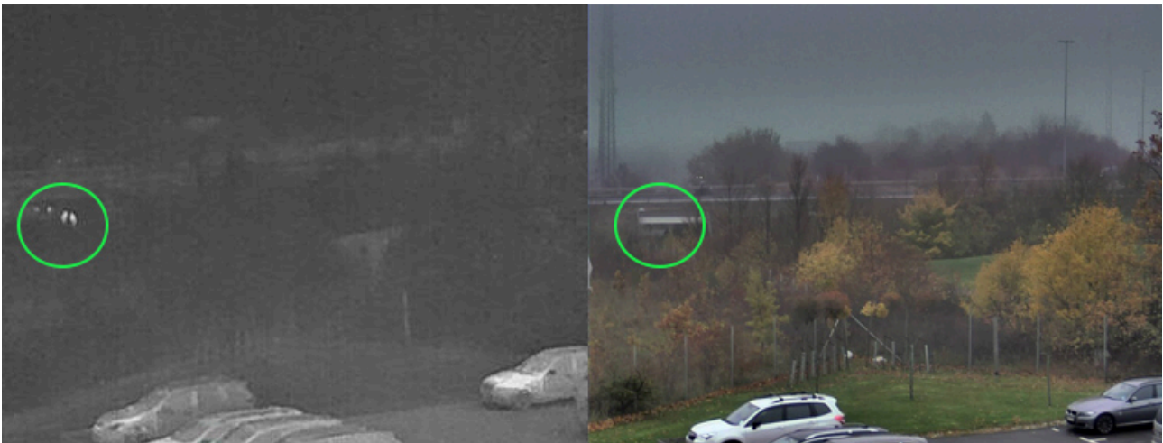
Images taken with a thermal camera (left) and a visual camera (right) on a rainy day. The individuals (circled for reference) are easily distinguished with the thermal camera.

While scattering means that less energy reaches the camera sensor, the levelled out background temperature does not influence the sensor. However, since the contrast of the image will be lower, it will be more difficult to distinguish details in the background and the image will look flatter. It will still be easier for a thermal camera to detect a person, since the contrast between the warm person and the cold background will be higher.