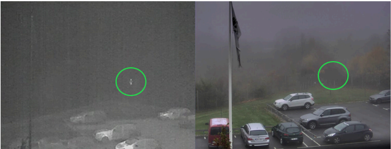
Images taken with a thermal camera (left) and a visual camera (right) on a foggy day. An individual (circled for reference) can be distinguished with the thermal camera but not with the visual camera.

One way to classify fog is the system used by the International Civil Aviation Organization (ICAO). Its categories are defined by the visual range in each type of fog. The table below lists these categories and also the approximate detection range of LWIR wavelengths for each class.