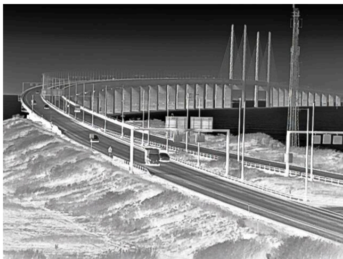
Sharp contrast in the background on a sunny day.