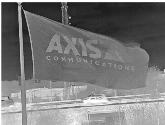
Flag disturbing the view.

Thermal cameras with support for electronic image stabilization are less affected by vibration. However, these factors should still be considered when installing a thermal camera, to optimize camera performance.